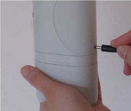
Figure 13. Charging Battery using the Power Supply

The Qfit™ fit tester battery should be recharged a minimum of 4 hours after 40 minutes (approximately 15 fit tests based on using protocol I) of actual pump runtime. With normal usage, this should be once per day. For high volume users, a second Qfit™ fit tester pump with battery is recommended. When the power in the battery becomes low, the yellow LED flashes to indicate that only a few minutes of battery power remains. You must recharge battery. During the charging operation, the yellow LED will light and automatically turn off after the battery is fully charged.