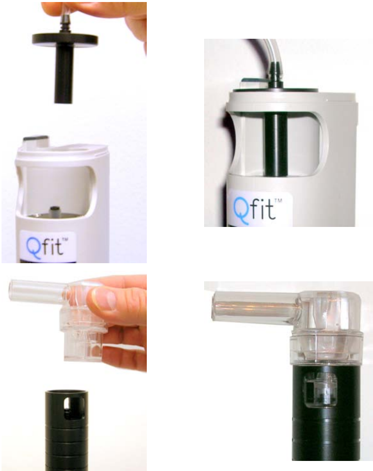
Figure 6. Attach Air Outlet and Cartridge in Remote Operation