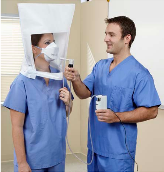
Figure 5. Remote Operation

Both manual and automatic Qfit™ Respirator Fit Testers can be operated under the remote mode. The Qfit™ fit tester Remote Accessory (TSI P/N 805015) is needed in order to run the Qfit™ fit tester under this mode.