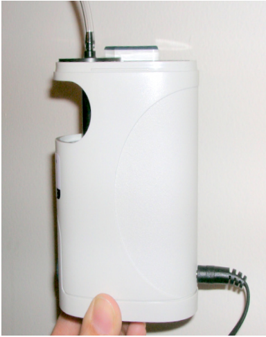
Correct—without Battery Attached