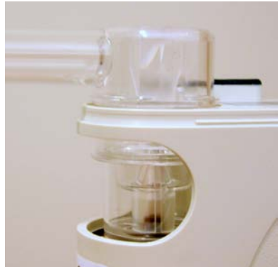
Figure 4. Plug Cartridge and Elbow into the Top of Qfit™ Tester