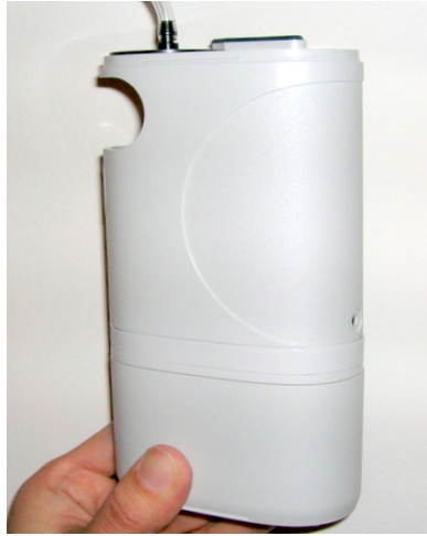
Incorrect—with Battery Attached