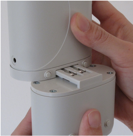
Figure 14. Removing/Replacing Battery