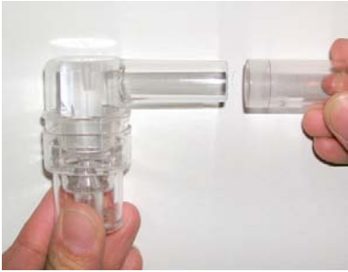
Figure 3. Attach Extension Tube to Elbow ( optional )