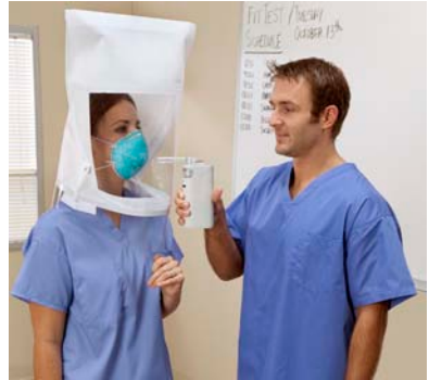
Table 2 Fit Test Timing Protocols of Qfit ® Respirator Fit Tester