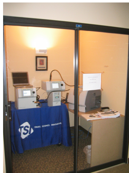
Figure 1: Phone booth office showing laser printer and measuring instruments